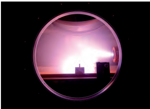
arcPECVD process operating in the labFlex® 200

Dual magnetron plasma source used for the magPECVD process